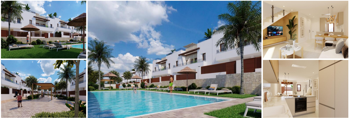
New Build Homes in Vistabella Golf Resort, Orihuela