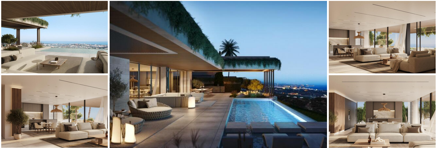
LUXURY NEW BUILD VILLAS WITH SEA VIEW IN BENAHAVIS

Residential is the perfect symbiosis of luxury and sustainability. The project has been greatly influenced by the constant dialogue with nature in order to mimic it without altering its condition. A new concept of silent, serene and friendly luxury that does not renounce sustainability is present in our design.