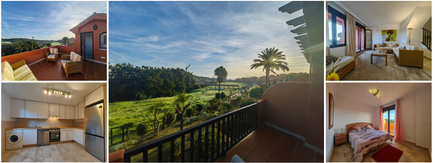
Luxurious Triplex Penthouse in Costa del Sol

Located in a prime area of the Costa del Sol, this stunning 200 m 2 duplex combines space, breathtaking views, and an active yet relaxed lifestyle.