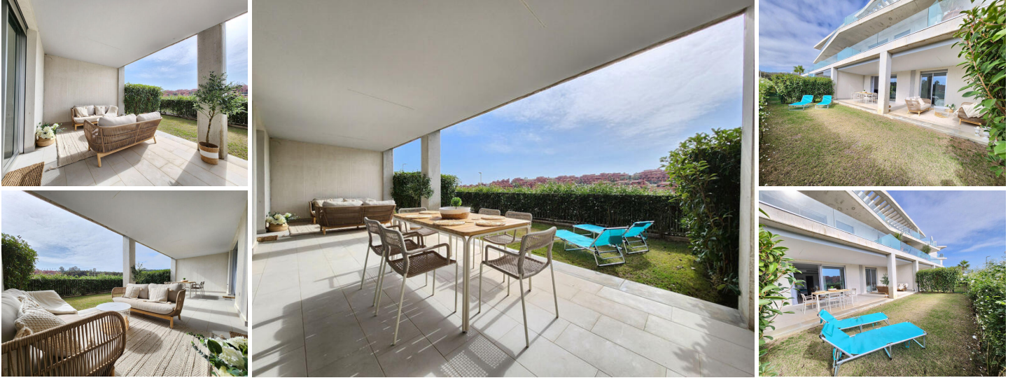
Spacious Ground Floor Apartment in Serenity Collection, Estepona

Discover this expansive ground-floor apartment in the exclusive Serenity Collection complex, located in one of Estepona's finest areas. With 134 m 2 of living space, this property features 3 bright bedrooms and 2 bathrooms, making it ideal for families or as an investment on the Costa del Sol.