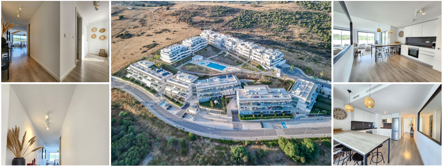
Penthouse in Estepona

Discover this stunning penthouse located in one of Estepona's most exclusive developments. This modern and bright home combines luxury and comfort, offering breathtaking sea views in a peaceful and privileged setting.