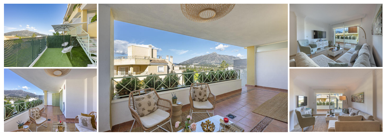
Excellent Opportunity in Las Brisas de los Naranjos, Nueva Andalucia.

We present this attractive flat refurbished just one year ago, in one of the most sought after areas of the city: Nueva Andalucía, Marbella, close to Los Naranjos Golf Club.