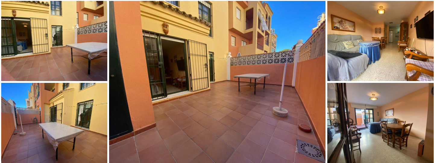
Beautiful Beachfront Apartment with Pool and Garage

If you're searching for an ideal apartment by the sea, this is your opportunity. Located in a gated community with direct access to the beach and the Coastal Path, this stunning apartment offers comfort, tranquility, and an excellent location.