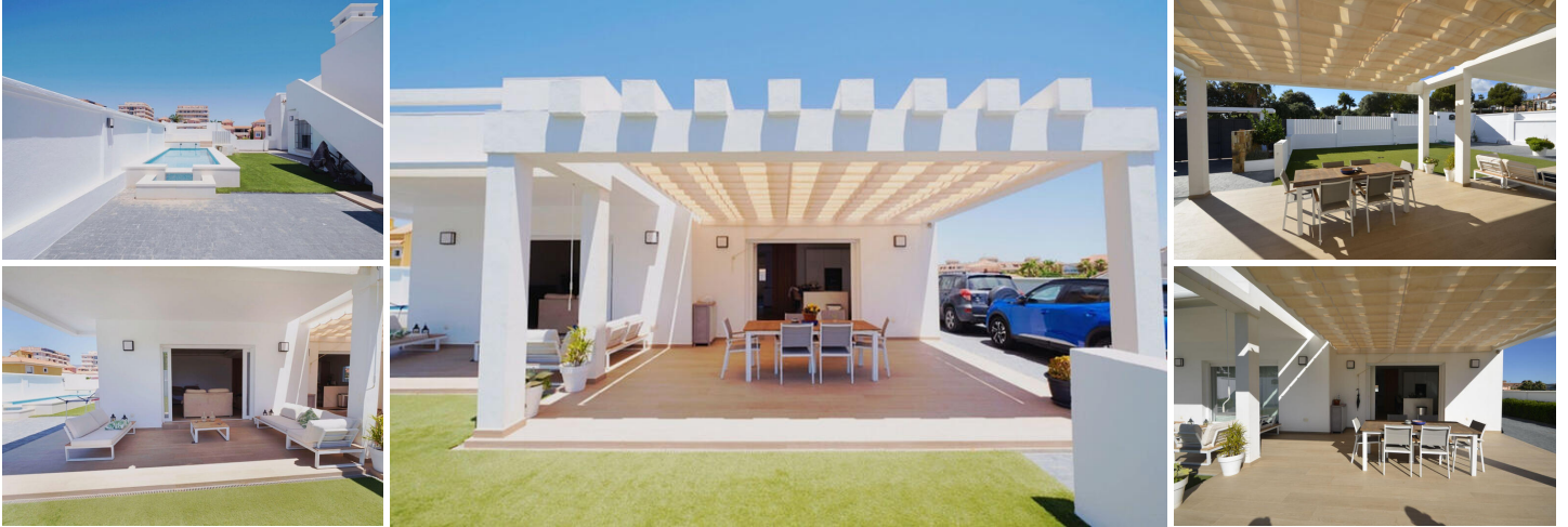
Stunning Independent Villa in the Heart of Sabinillas 1.850.000€

This beautiful modern villa is ideally located in the vibrant town of Sabinillas, offering both comfort and convenience. The property features a spacious layout, with all living areas and bedrooms conveniently situated on one level.