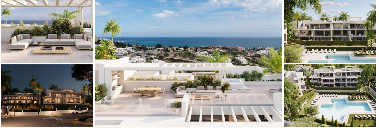
Modern Living in Estepona: Spacious Apartments with Sunny Terraces