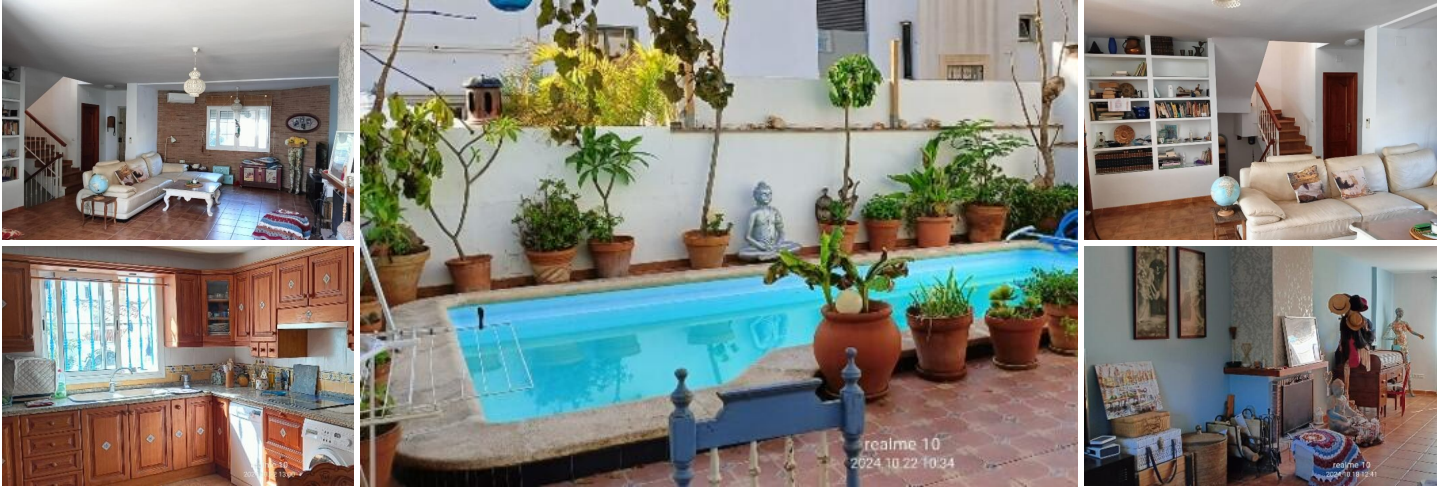
Villa For Sale In Nerja

This property has 168 m2 distributed over three floors.