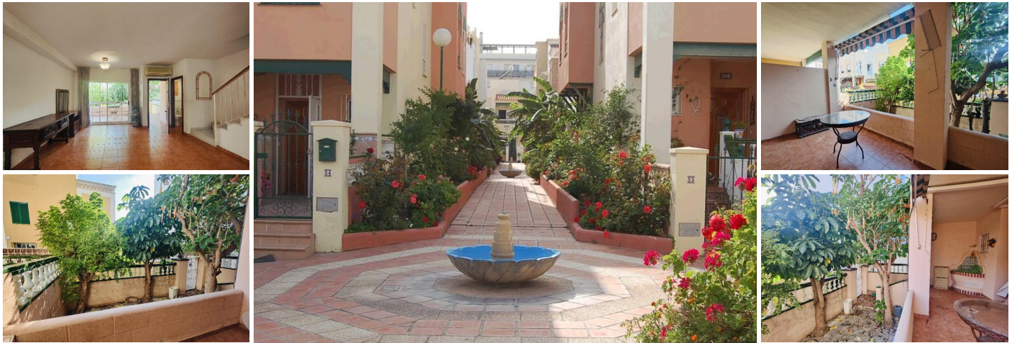
Townhouse For Sale In Nerja

Large townhouse situated in one of the best areas of Nerja, next to the Torrecilla Beach, in the Urbanization Nerja Medina.