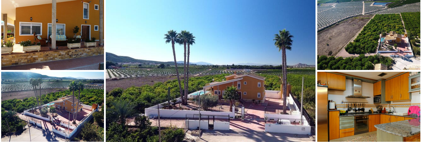
AMAZING COUNTRYSIDE FINCA WITH INCOME

9,480 m2. fully fenced property with 495 m2. house built on a plot of 1,000 m2. all fenced within the perimeter of the property.