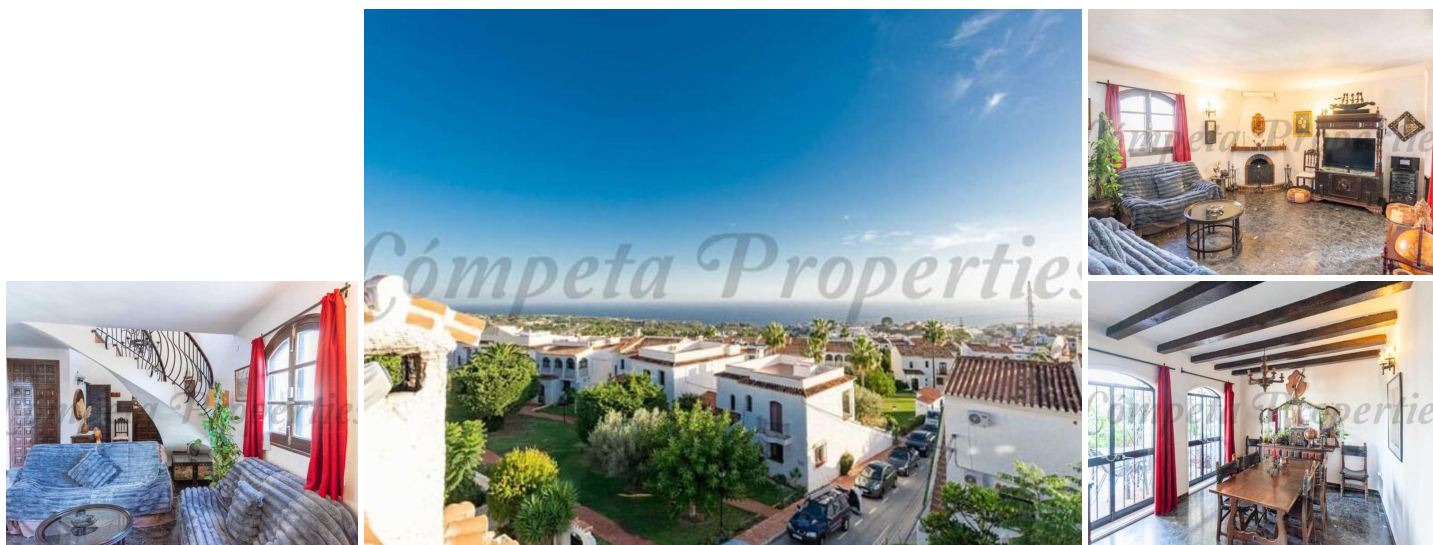
Charming 2-Bedroom Townhouse with Stunning Sea Views in Capistrano Village, Nerja

Discover your new home in the picturesque Capistrano Village, one of Nerja's most sought-after areas. This spacious 2-story townhouse features two large bedrooms with ample storage, a newly renovated bathroom upstairs, and an additional convenient toilet on the ground floor. The main floor offers a cozy living room with a traditional fireplace, perfect for relaxing, and a fully equipped kitchen for all your culinary needs.