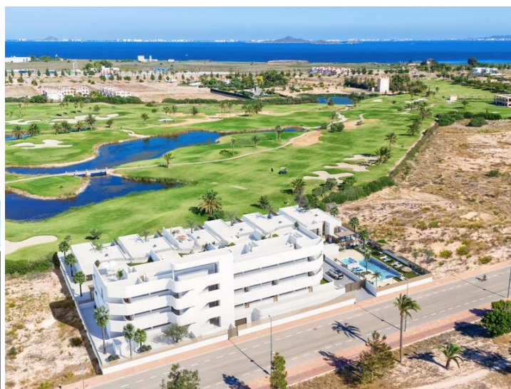
New Build Residential complex in Los Alcazares

Los Alcázares is an idyllic location for those looking to invest in a new residential property on the Costa Cálida. Just 25 minutes from Murcia Airport and approximately 55 minutes from Alicante Airport, this area is conveniently connected by highway to major cities like Cartagena, Murcia, and Alicante, as well as to other beautiful beaches along the Costa Cálida and Costa Blanca.