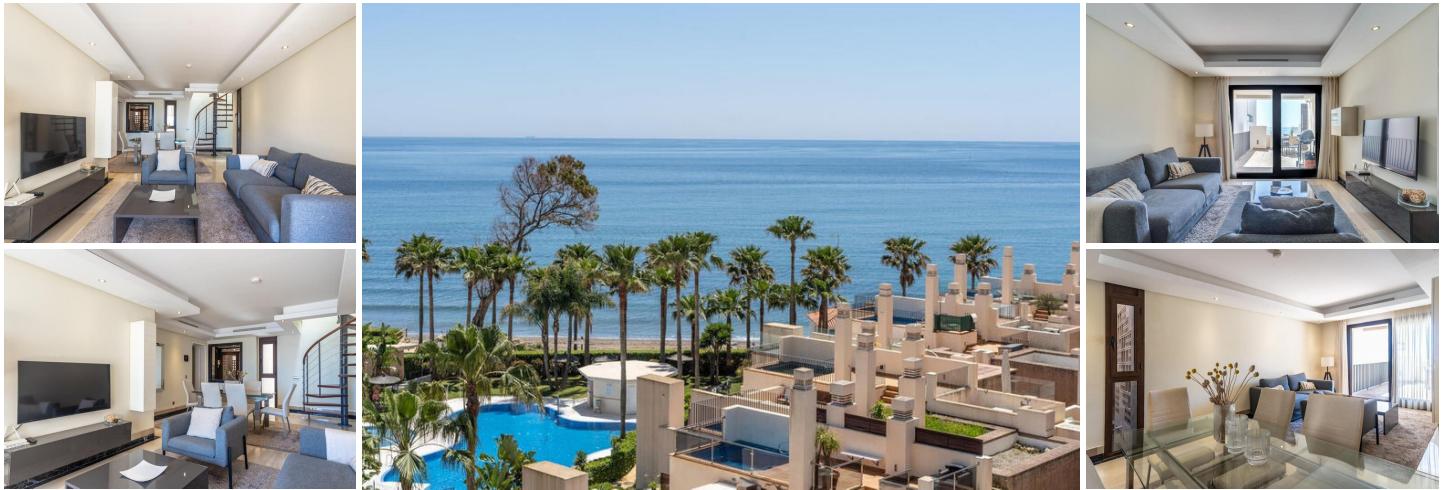
NEW GOLDEN MILE, ESTEPONA ... 2 Bedroom, 2 Bathroom Penthouse

FREE Notary fees exclusively when you purchase a new property with MarBanús Estates