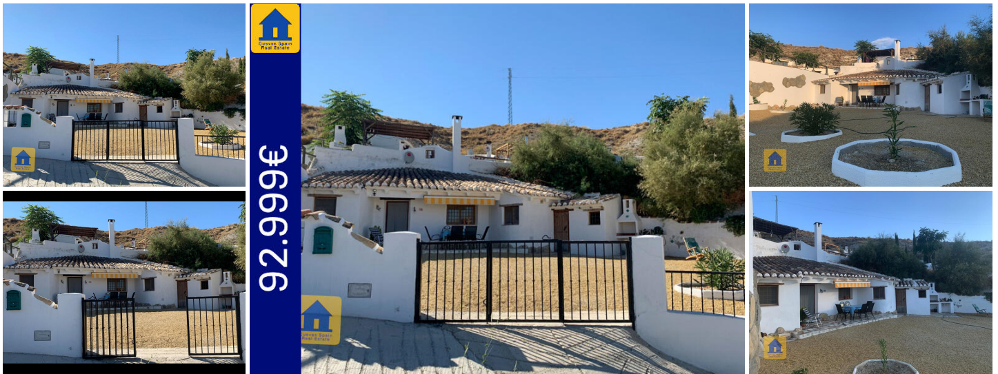
Cave Mabs in Galera

This is one of the beautiful caves found in the village of Galera. This property is located in the heights of Galera and has stunning views over the mountain ranges. It has an expansive, gated patio with potential for a garden, jacuzzi or above ground pool. From the patio, you enter the spacious living/dining room with high ceilings and lots of light. To the right is a lovely, fully fitted kitchen. Straight ahead upon entering is a hall area leading to two bedrooms. To the left is a bathroom and hallway leading to the master bedroom with ensuite bathroom. Outside, to the right of the cave, is a utility room with the washing machine and storage space. This cave is impeccably designed and maintained with great taste and care. The property can be purchased fully furnished (negotiable) and is ready to move in. The village center with amenities, restaurants and tapas is a 10-15 min walk away.