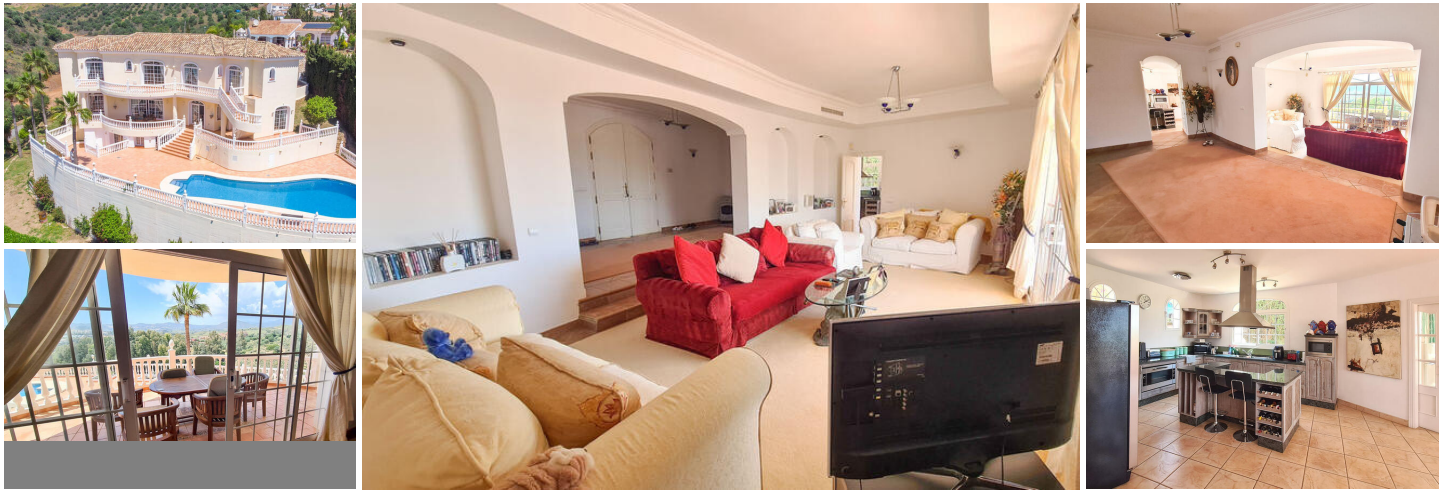
Elegant Frontline Golf Villa with Pool, Panoramic Views & Prime Location

Discover this stunning 5-bedroom villa + apartment, perfectly positioned on the prestigious Mijas Golf urbanization. Offering breathtaking panoramic views of the golf course and surrounding landscapes, this exceptional property is just 15 minutes from the beautiful beaches of Mijas Costa and Fuengirola, with convenient access to shops, restaurants, and Malaga Airport, only 30 minutes away.