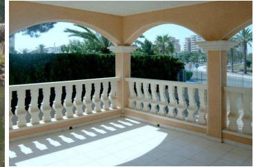
LUXURY VILLA WITH PRIVATE PIER

Between two seas, the Mar Menor and the Mediterranean, is this beautiful luxury villa on the La Manga peninsula (Murcia), with one of the most privileged views in the area, (and being a few meters from the beach) This property has a private jetty (for a boat up to 12 m) that allows access to the sea through a system of wide channels.