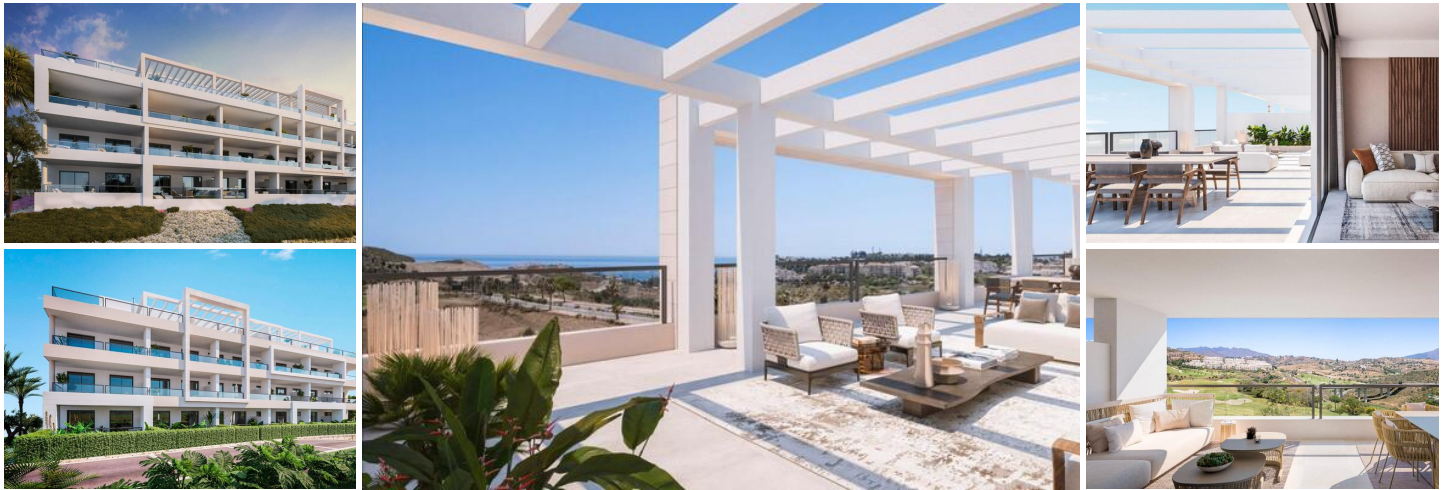
NEW BUILD RESIDENTIAL COMPLEX IN LAS LAGUNAS DE MIJAS

New Build residential complex in Mijas Costa, Malaga.