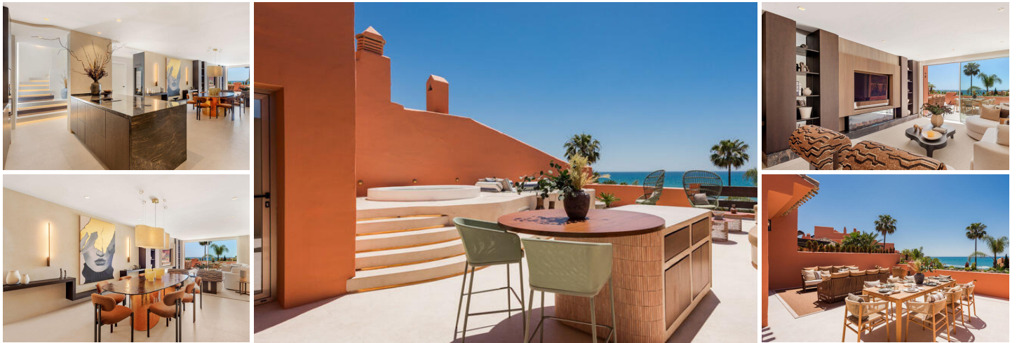
Duplex Penthouse - 1st Sea Line - Marbella EST

In a seaside residence, with 10,000m 2 of tropical garden, outdoor and indoor heated swimming pool, gym, we present to you this sumptuous penthouse with panoramic views.