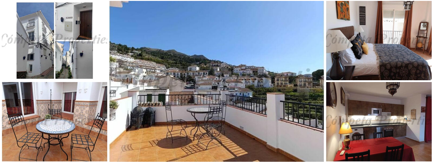
Apartment Complex with 5 Self-Catering Units in Canillas de Albaida.