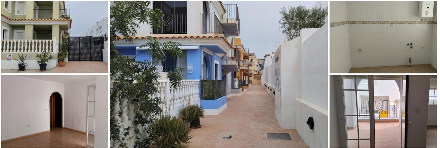
Penthouse with Solarium and Spectacular Views of the Sea and Mountains in Palomares

Discover this magnificent penthouse with a solarium offering a stunning 360-degree view of the sea and mountains, located in the charming village of Palomares.