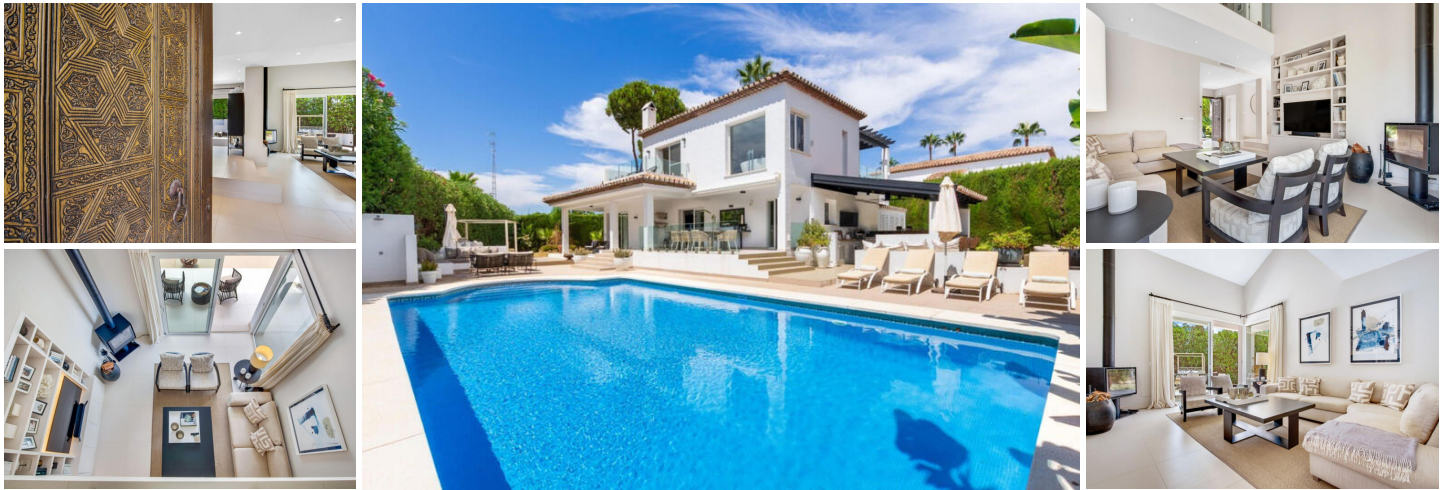
NUEVA ANDALUCIA ... 4 Bedroom, 5 Bathroom Villa

FREE Notary fees exclusively when you purchase a new property with MarBanus Estates