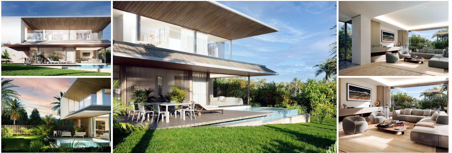
NEW & CONTEMPORARY Villa - El Paraiso, Estepona

This Villa, part of an exquisite collection of 15 private villas, is strategically positioned on the esteemed New Golden Mile of Costa del Sol, offering a unique opportunity to own a luxury private residence in an enviable location near golf courses, beaches, and the premier destinations of the Costa del Sol.