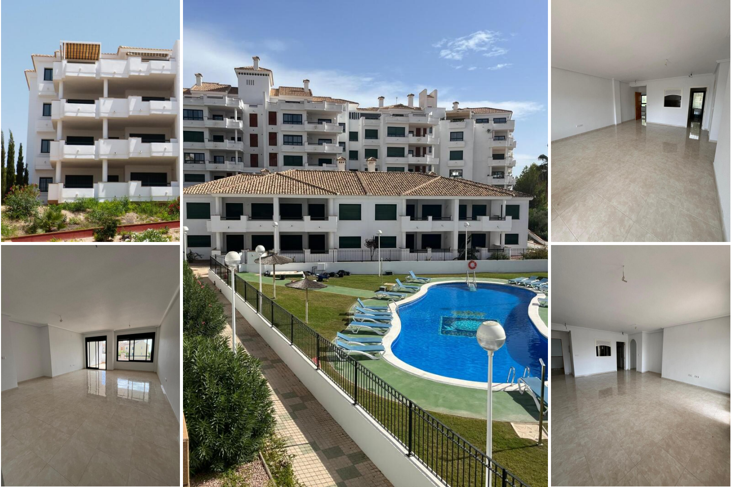
Key Ready Apartments for Sale in Lomas de Campoamor, Orihuela Costa