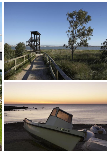
New Residential Development in Torrevieja, Just 1 km from the Sea