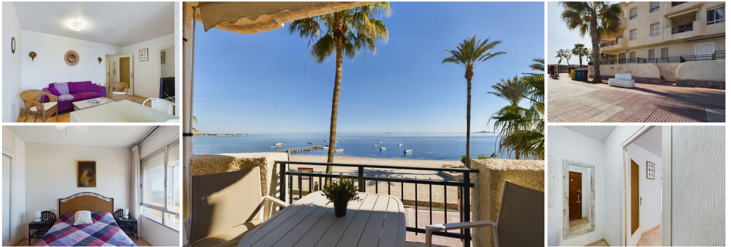
Elegant Frontline Apartment with Exceptional Views

This 3-bedroom, 2-bathroom apartment is a rare opportunity to enjoy a stunning coastal lifestyle.