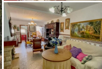
Cortijo Patricios - A country house in the Albox area. (Resale)

A large 7-bed, detached country house with great views set in 24.973 m 2 of land planted with olive and almond trees situated just a few minutes from the city center of bustling Albox. In the commercial city of Albox you will find all amenities such as pharmacists, doctors, 24-hour medical post, all kinds of boutiques, supermarkets such as Mercadona, Aldi and Lidl, bars and restaurants and even a real Belgian chip shop..