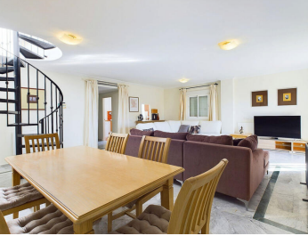
Stunning 3-Bedroom, 3-Bathroom Penthouse with Breathtaking Views – Must See!

Discover the ultimate in luxury living with this spectacular 3-bedroom, 3-bathroom penthouse, nestled within an exclusive gated community of just 42 properties. Offering breathtaking panoramic views of the southern Costa del Sol, this corner-unit residence is a true gem!