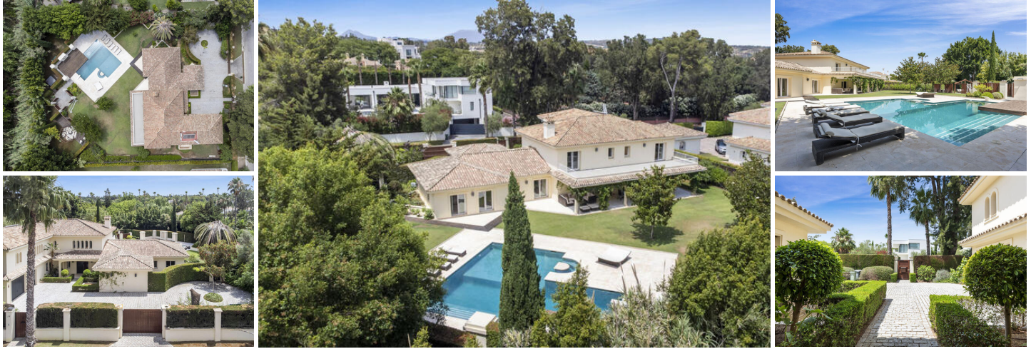
Modern Andalusian Villa in the Prestigious Kings and Queens, Sotogrande Costa

Welcome to this exquisite Modern Andalusian Villa, situated in the prestigious Kings and Queens area of the highly sought-after Sotogrande Costa location. This exceptional property offers a perfect blend of contemporary luxury and traditional charm, set on a generous south-facing plot with mature gardens and versatile entertainment spaces. The villa features a large swimming pool surrounded by natural flagstones and decking, providing the perfect environment for relaxation and social gatherings.