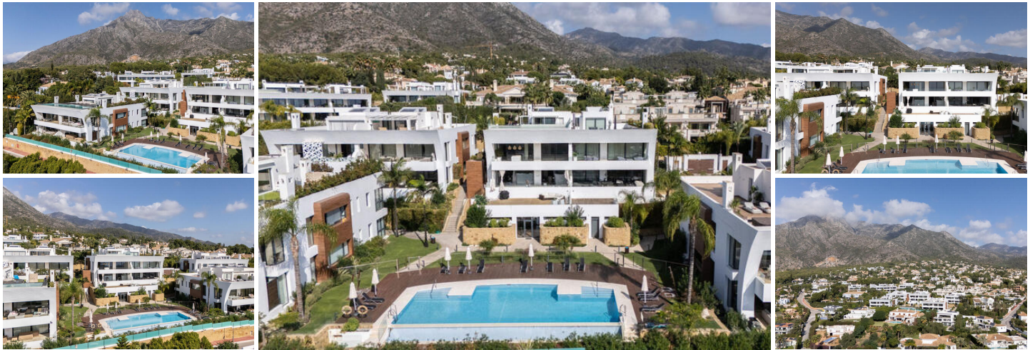
Elegant Two-Level Penthouse with Panoramic Views in La_Reserva

La_Reserva_a is an exclusive and secure luxury community located in one of Marbella's most prestigious areas. The complex is surrounded by beautifully maintained gardens and offers a wide range of amenities for comfortable living and relaxation. With high-level security, privacy, and breathtaking views of the Mediterranean Sea, La Concha mountain, and the coastline, this is the ideal place for those who value seclusion and elegance.