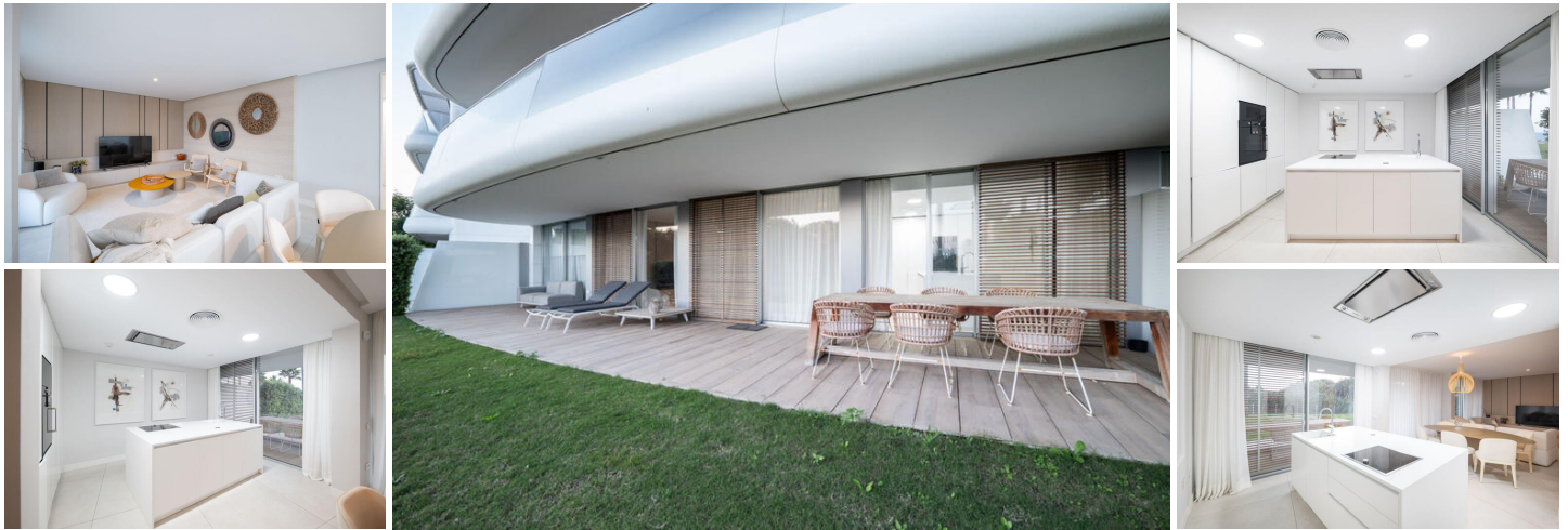
Luxurious Ground Floor Apartment in The Edge, Estepona

The Edge in Estepona is an exclusive beachfront residential complex offering modern apartments with panoramic views of the Mediterranean Sea. This ground floor apartment features three bedrooms, including a master bedroom with an en-suite bathroom and walk-in closet, a second bathroom, a guest toilet, a spacious living room, a fully equipped kitchen, and a large private terrace. The property is further enhanced by a generous private garden, ideal for outdoor living and relaxation.