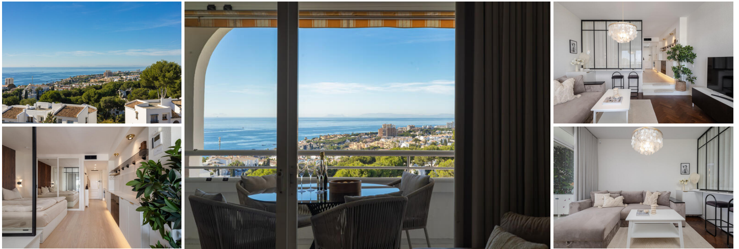
Fully Renovated Penthouse in Miraflores with Panoramic Ocean Views

This fully renovated top-floor penthouse, located in the prestigious Rancho A urbanization in Miraflores, offers 61 sqm of total space, including a 11 sqm terrace and 50 sqm of built interior. With a southwest orientation, it boasts breathtaking panoramic ocean views and stunning sunsets, just 500 meters from the beach.