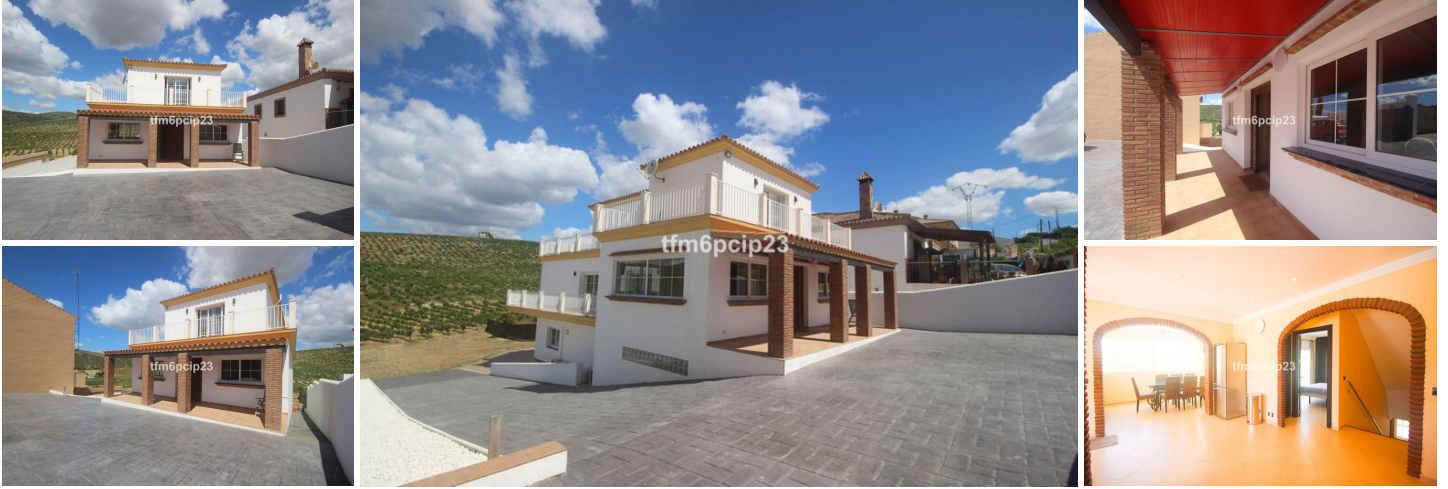
Exquisite Detached Villa in Manilva, Costa del Sol