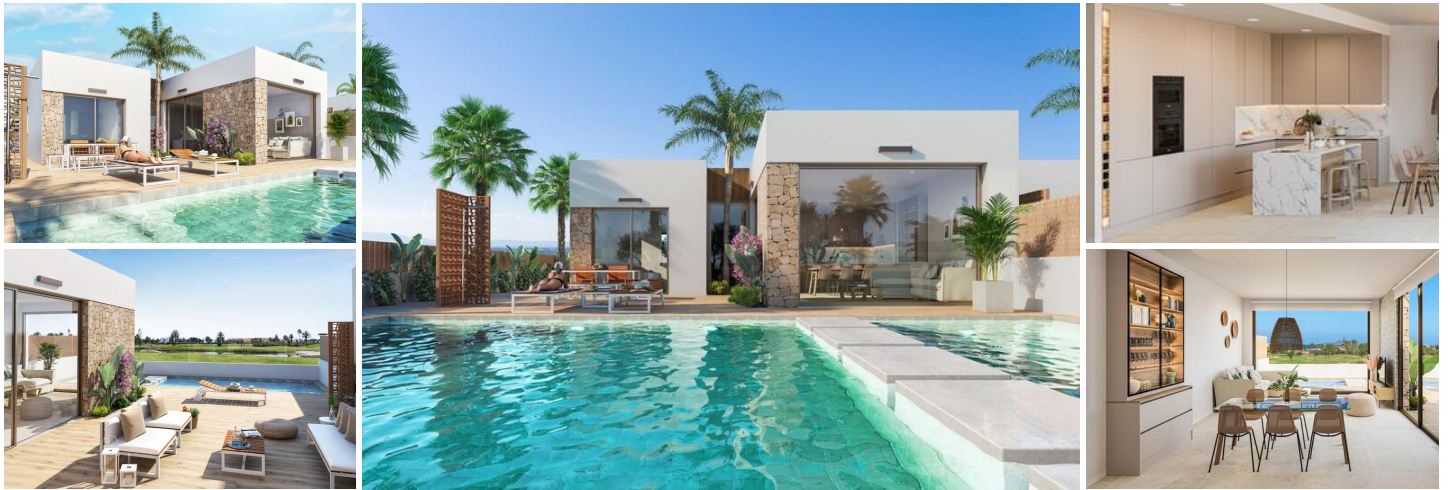
New Build Villas in Los Alcazares

Los Alcázares is an idyllic location for those looking to invest in a new residential property on the Costa Cálida Just 25 minutes from Murcia Airport and approximately 55 minutes from Alicante Airport, this area is conveniently connected by highway to major cities like Cartagena, Murcia, and Alicante, as well as to other beautiful beaches along the Costa Cálida and Costa Blanca