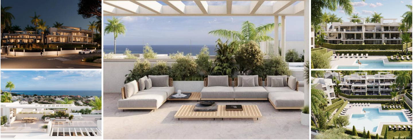
Modern Living in Estepona: Spacious Apartments with Sunny Terraces