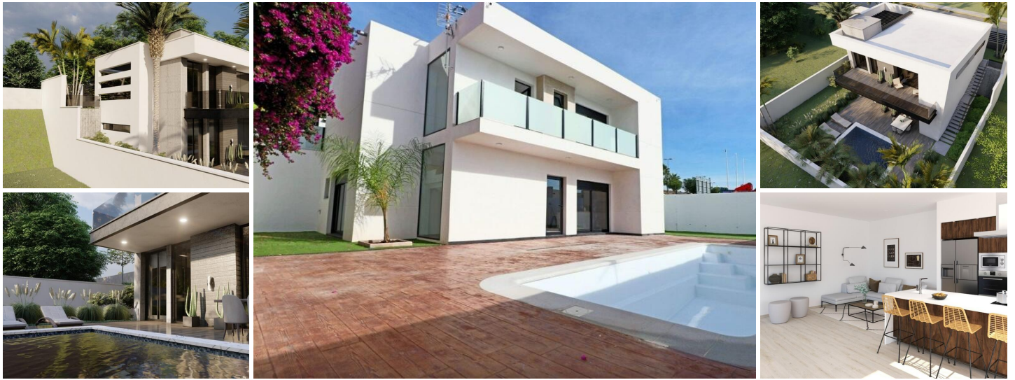
NEW BUILD VILLAS IN FORTUNA