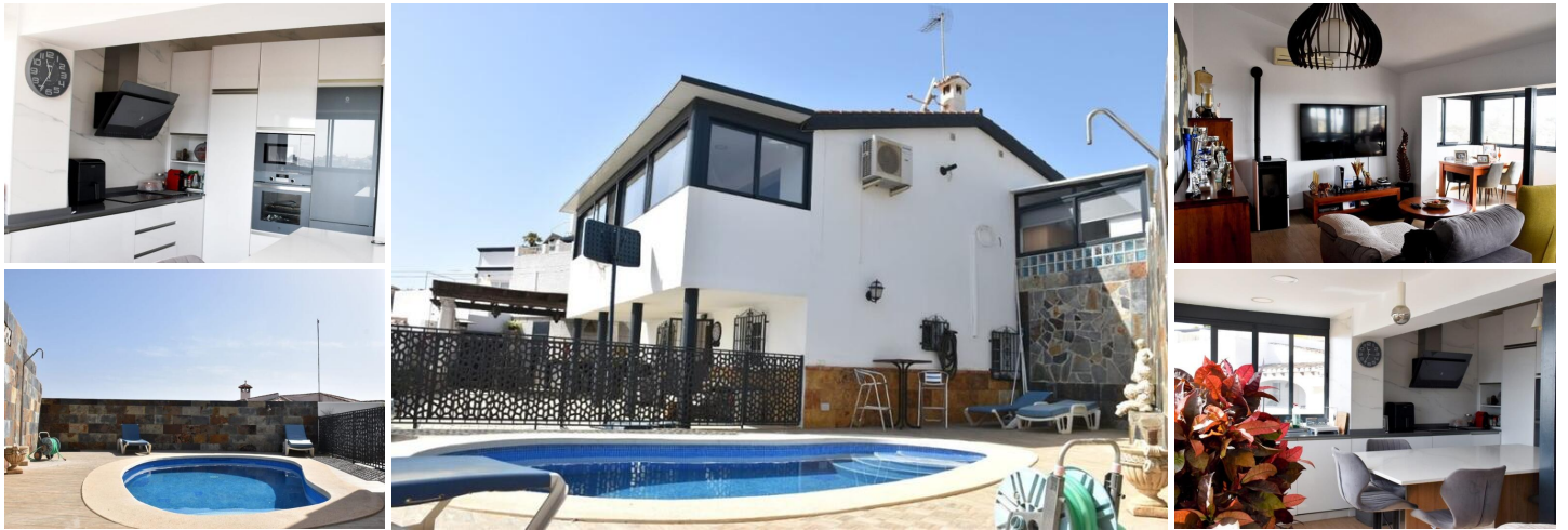
Detached Villa With 3 Bedrooms For Sale In Nerja

If you are looking for one of the leading estate agents in Nerja, then please contact Villasol Real Estate in Nerja for our expert advice.