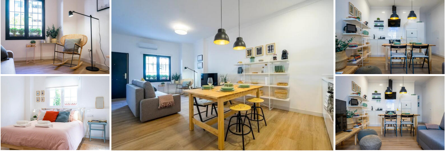
A One Bedroom Apartment For Winter Rental Located Near The Beach And Town

The apartment has been recently renovated, with aircon and heating. Has A Communal roof terrace with pool and views to the sea and mountains. The kitchen has a full oven and ceramic hob.