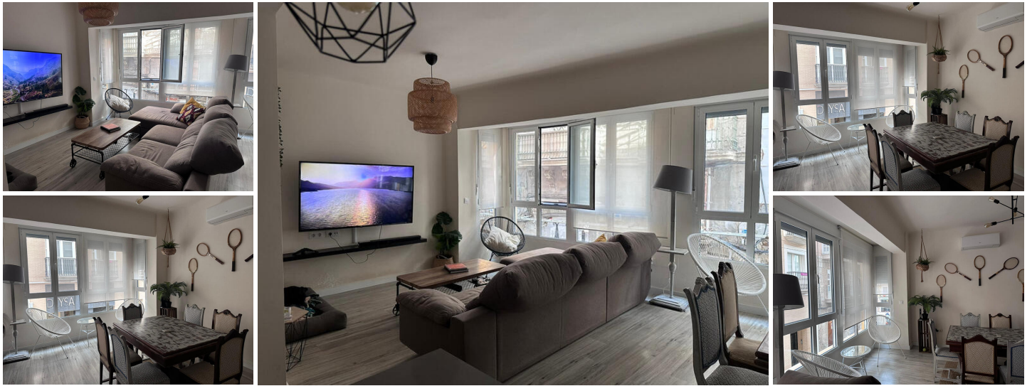
Renovated Modern 3-Bedroom Apartment in Cartagena's Old Town

This stylish first-floor apartment is located in the heart of Cartagena's historic old town, combining modern comforts with the charm of its iconic surroundings.