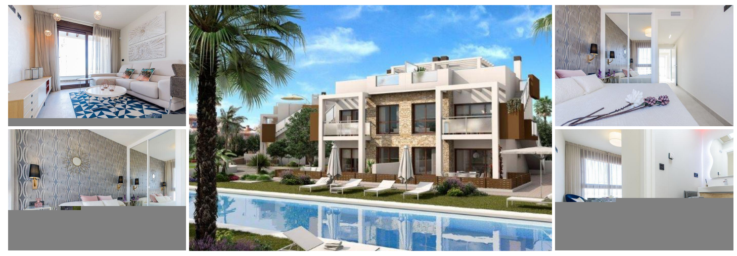
NEWLY BUILT BUNGALOWS UPPER FLOOR WITH PRIVATE SOLARIUM !!!

New Project of 100 Bungalows on the upper floor with private solarium and ground floor with private garden located in a residential area of Los Balcones, with easy access, close to several golf courses, hospital and all services.