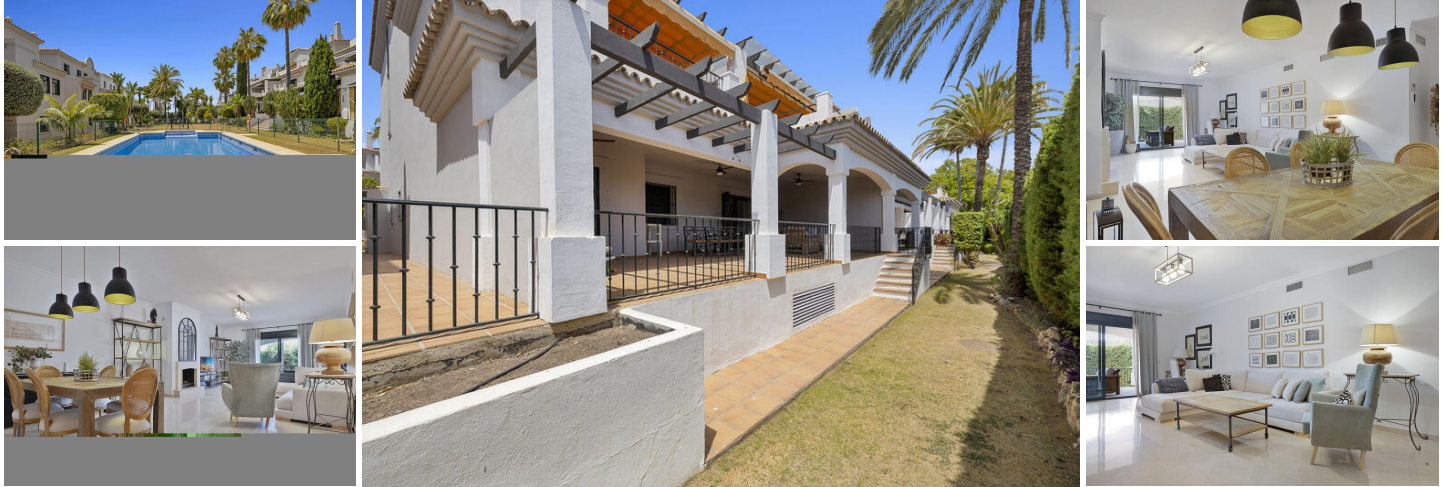
Ground floor apartment - San Pedro de Alcantara

Facing due south, here is a ground floor of 178m 2 surprising by its volumes and its privacy. Ideally located, you will be close to shops on foot but also to the beach (1 km) and the city center.