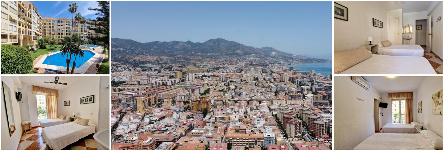
Fuengirola , Costa del Sol

Great investment opportunity, with over 85% occupancy in 2022 and 2023.... this may be the only hostel offering a very nice swimming pool and landscaped gardens in Fuengirola, located within walking distance to the beach, town centre and train station. The hostel has been in operation over 25 years, it is well known, it has 12 rooms (some with terraces overlooking the swimming pool, 9 of the rooms with ensuite bathroom, 3 other rooms share a full bathroom, great occupancy rates and very profitable. A highly rated hostel for its cleanliness, location, proximity to beaches, price /quality rating and attention given to clients by staff. Close to all shops and services and less than 5 minute walk away from the golden sandy beaches and train station.