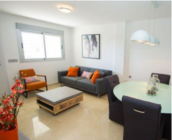
Magnificent apartment between the sea and the golf!

Cozy apartment with 2 bedrooms and 2 bathrooms