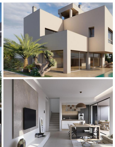
NEW BUILD VILLAS IN TORRE DE LA HORADADA

Exclusive Residential of 2 luxury villas with sea views in "Las Higuericas" beach, Torre de la Horadada