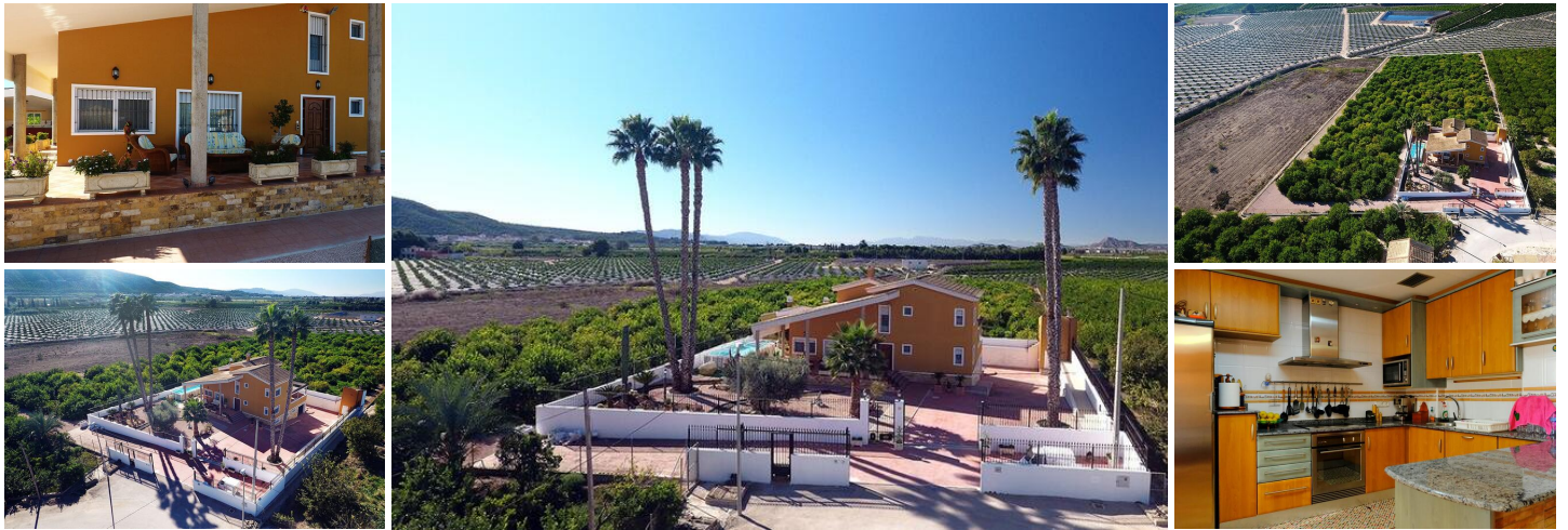
AMAZING COUNTRYSIDE FINCA WITH INCOME

9,480 m2. fully fenced property with 495 m2. house built on a plot of 1,000 m2. all fenced within the perimeter of the property.