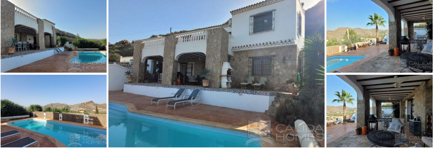
Cortijo Flounders – Cantoria

This totally reformed 3 bedroom, 4 bathroom 2-storey cortijo is full of character with a modern twist and has spectacular views, swimming pool, covered terrace, semi open plan modern kitchen, laundry room, storage room, lovely lounge, roof terrace, air conditioning, car port and much more.