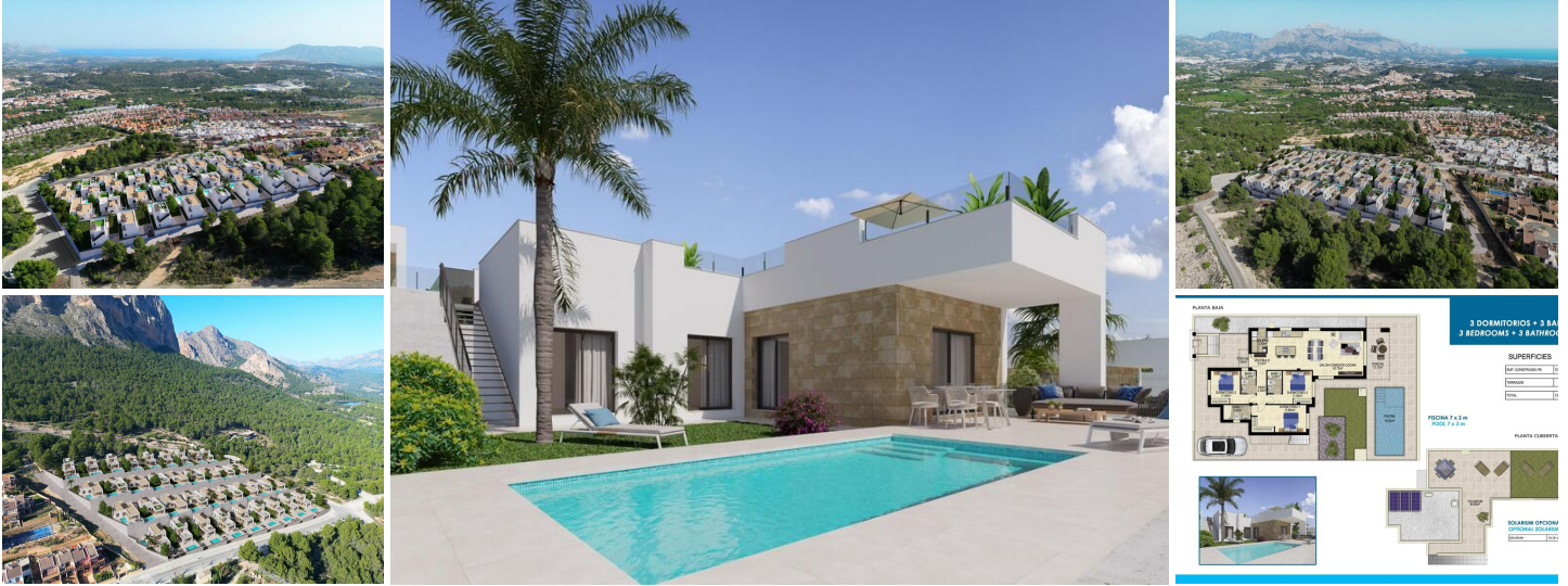
Stunning New Build Villas in Polop with Sea Views