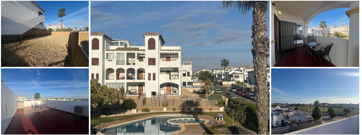
Stunning 2-Bedroom Penthouse with Private Solarium in La Ciñuelica, Playa Flamenca

This beautifully maintained 2-bedroom, 2-bathroom penthouse in the desirable La Ciñuelica area of Playa Flamenca is perfect for those seeking a stylish and comfortable home. With a private solarium offering stunning views and a private plot for extra outdoor space, this property provides the ideal balance of indoor and outdoor living. Facing the charming communal pool, the penthouse comes fully furnished and includes the added convenience of an underground parking space.