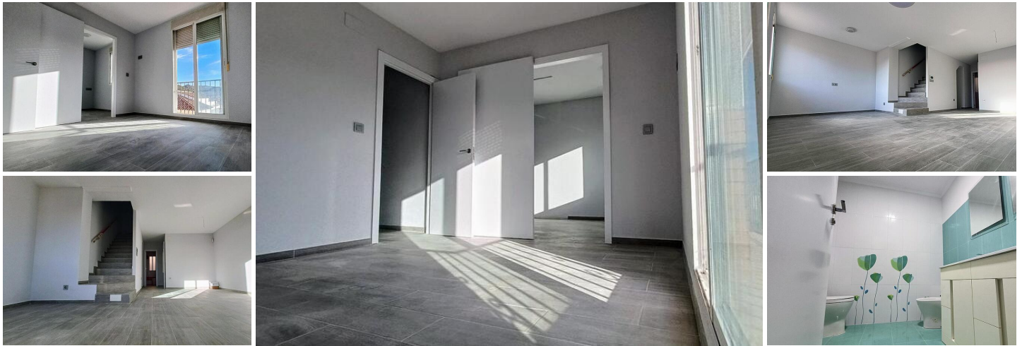
Townhouse for sale in La Romana, Alicante, Costa Blanca